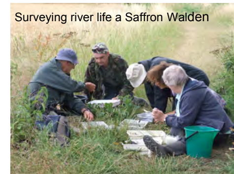
Surveying river life a Saffron Walden