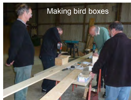
Making bird boxes