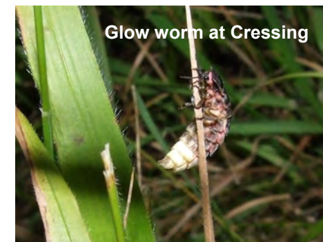
Glow worm at Cressing

Wednesday April 20 th sees the beginning of the group's summer season of weekly evening activities, which continues all the way through to early September, when the daylight fades just too early to allow us to continue and we have to go into virtual hibernation again, relying on monthly indoor meetings to keep going.