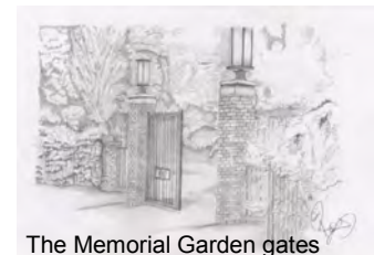
The Memorial Garden gates